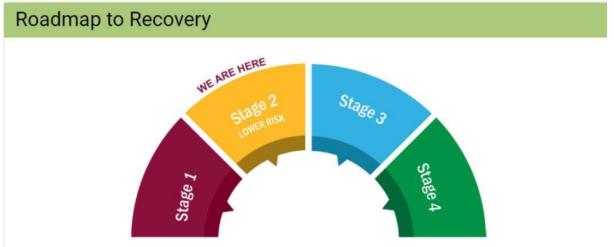
Imperial County's Roadmap to Recovery

Over the last several weeks, California counties, in coordination with the California Department of Public Health, have worked extensively to create a meaningful framework that supports the decision to reopen local economies.